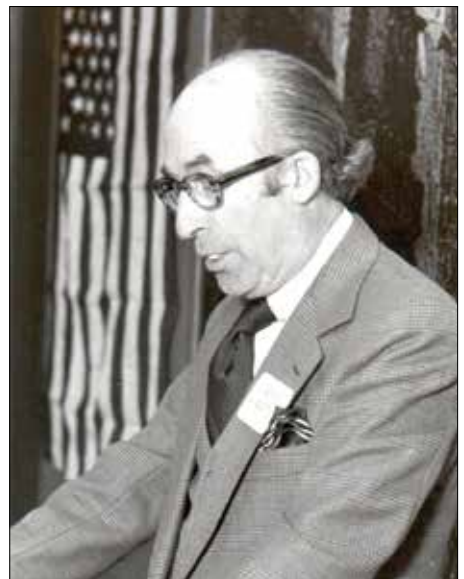
(Top) Turkish Express, ATAA Annual Convention 1982